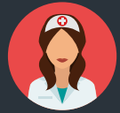
RN & PA